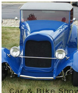
Car & Bike Show

If the summer heat gets unbearable, you can always cool down and have some fun with the ultimate water balloon game -- Water Wars. Water Wars is located on Bray Street on the east side of the park.